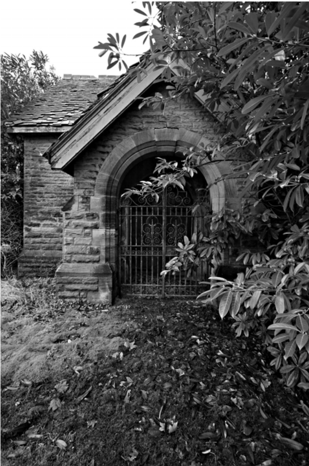
Chapel entrance

On the gatepost of a field in Menston, West Yorkshire, there used to be a plaque (see cover photograph), which stated that 'this site is the last resting place of 2,858 patients from High Royds Hospital who died between 1905 – 1969. May they rest in peace.' There are no gravestones, no flowers, no names, just an expanse of grass, with a little dilapidated chapel building.