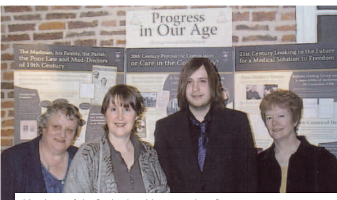
Members of the Rutland and Leicestershire Recovery group with their exhibition

The group's resources are limited but workable. Together for Wellbeing has given us unstinting support since we started, and we often meet in their London offices. We do not have a regular income, but the Hamlet Trust gave us $4,000 as a stimulus and we have had generous donations from individuals; we rely on the support of members and supporters and donations are always welcome.