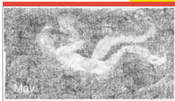
Stillness by May (Dancing for Living)