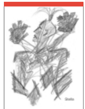
Staccato by Stella