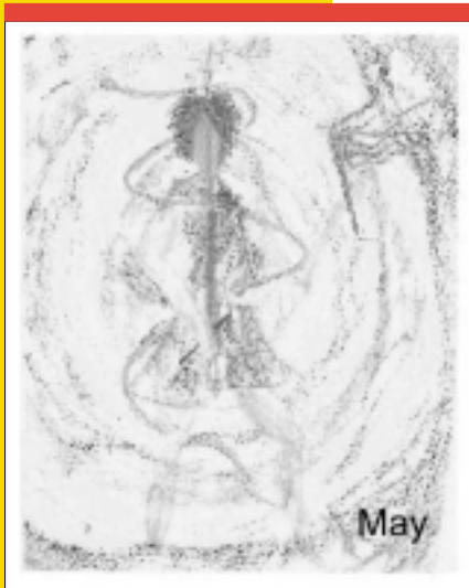
By May (Dancing for Living)

In Northern Ireland, research participants said that there were not enough therapeutic activities. There was a lack of access to activity rooms, which were