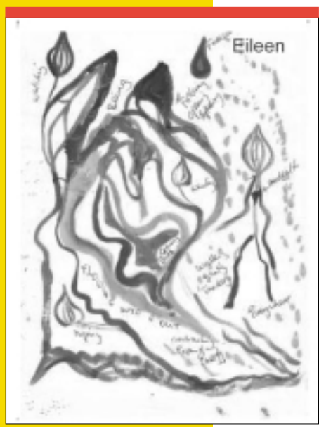
By Eileen (Dancing for Living)

'a lot of people had been given no support at all'