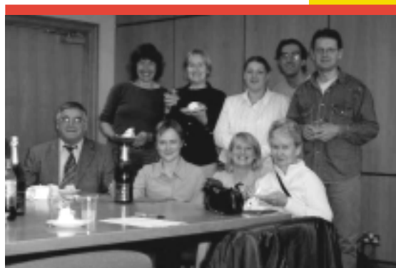
Strategies for Living staff (current & past), researchers and advisory committee members

Interviewees in the Black women's project, and again in the 'Coping with Unusual Beliefs' work (see page 2) highlighted the pain of isolation. In these projects some participants felt separated from and afraid of mainstream society, and in the later project, developing sometimes quite complex and sophisticated techniques for making themselves feel safe enough to venture out of home. ■