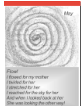
Flow by May

Although the picture painted by the findings is a complex and sometimes bleak one, the plethora of self-help and healing strategies has been inspiring. These underline both the interdependence of humanity in reaching across to one another at times of need, and the amazing capacity of individuals to find ways of coping or living with the extremes of experiences of distress. We hope that the experiences and findings of these projects will motivate, encourage and inspire others to try both old and new strategies for living. ■